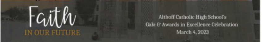
Table of eight $1,000.

RSVP by 2/24 go to althoffcatholic.org click "giving". Tickets $125 ea/