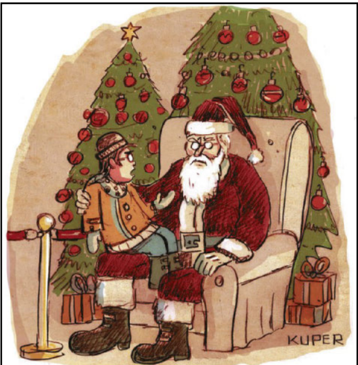
“ I get you have overnight delivery, but what’s your return policy?”

’T’was the day after Christmas and all through the house, not a creature was stirring, not even a mouse. The family members were all snuggled tight in their beds while visions of yesterday’s meals danced in their heads. The stockings had been torn from the mantle with glee and wrapping paper was strewn around the lit tree. The dishes, quite dirty, still sat in the sink not even a clean glass was available if you wanted a drink. The radio was blasting songs from the genre “classic rock” and nary a Christmas song was heard ‘round the block. The parents, with dread, were feeling a bit ill knowing that soon, in the mail, they would receive their bills. On Visa, on American Express, on MasterCard as well. A Merry Christmas to all and “the check’s in the mail.”