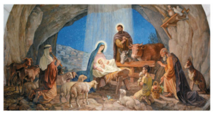
Christmas 2021 The angel said to them, "Do not be afraid; for behold, I proclaim to you good news of great joy that will be for all the people." Luke 2:10