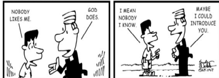
2ND SUNDAY IN ORDINARY TIME

Announcing a Lifeline of Hope and Healing for Struggling Marriages! When the old ways aren't working, the Retrouvaille Program helps couples restore their marriages and rebuild loving relationships. This is a three-phase program that begins with a weekend stay in the Wausau area. A series of "post sessions" provide ongoing healing and support. Presentations are given by couples who share their personal struggles in marriage and the tools they used to rediscover their love. Participants reflect and interact in privacy with their spouse. It is not group therapy. Costs are affordable and no couple is turned away because of limited finances. If you are wondering if this program is right for you or a loved one, find more information and answers to Frequently Asked Questions at www.HelpOurMarriage.org or call toll-free: 1-877-922-HOPE (4673) All calls are fully confidential. The next program begins on February 18-20, 2022. Space is limited. Early registration is recommended!