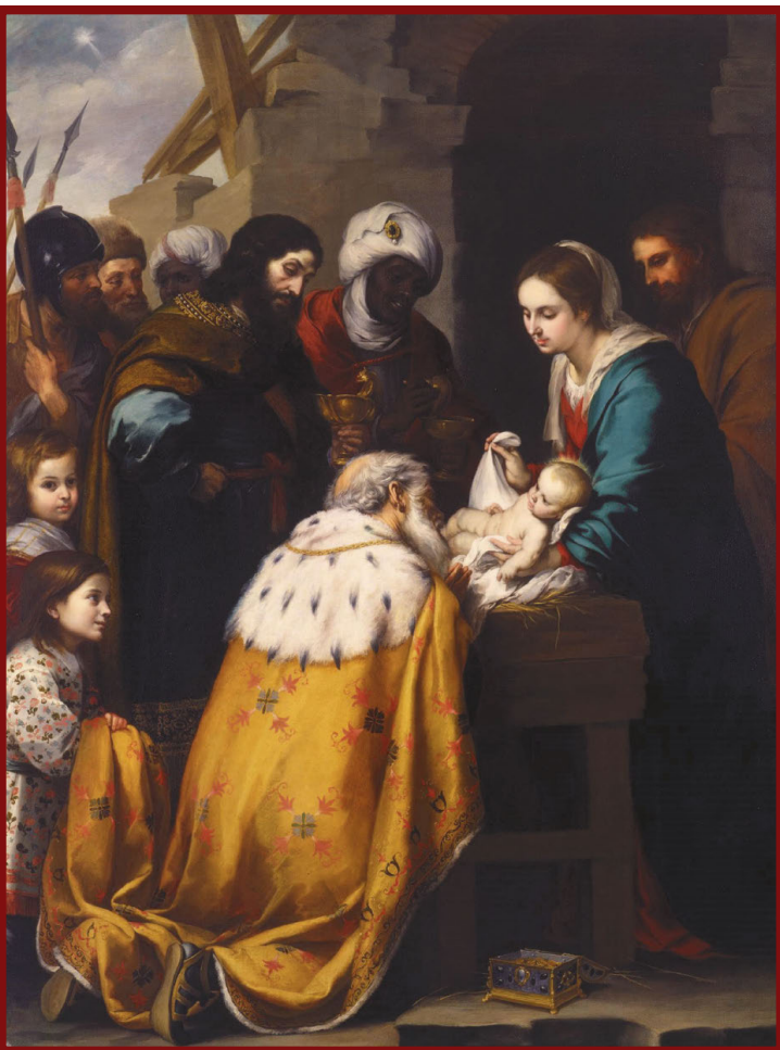
Cover: Adoration of the Magi, Bartolomé Esteban Murillo, 1655, Toledo Museum of Art, Ohio.

Bartolomé Esteban Murillo became the leading painter in devoutly Catholic Seville, Spain, from the 1640s to the end of his life. He painted almost exclusively for Seville's many churches and religious orders. This painting is his only known depiction of the Adoration of the Magi—the wise kings from the east who come to worship the Christ Child. Murillo treats the subject in an appealingly human way, convincingly expressing the joy, solemn contemplation, and humble devotion of the three kings and their entourage as the infant Jesus is tenderly presented to them by the young Virgin Mary.