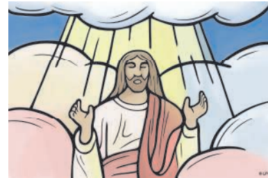
Excerpts from the Lectionary for Mass ©2001, 1998, 1970 CCD.

A cloud came and cast a shadow over them, and they became frightened when they entered the cloud. Then from the cloud came a voice that said, "This is my chosen Son; listen to him." After the voice had spoken, Jesus was found alone. - Lk 9:34b-36b