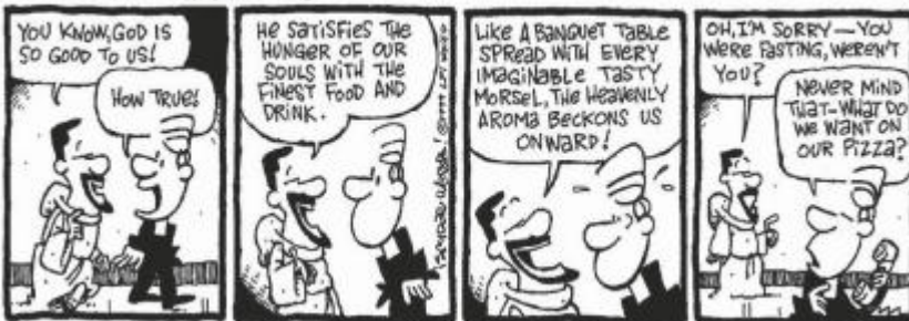
18 th SUNDAY IN ORDINARY TIME