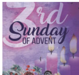
3RD SUNDAY OF ADVENT

Bible Study: Stay tuned! Starting another series soon.