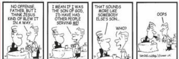
BAPTISM OF THE LORD