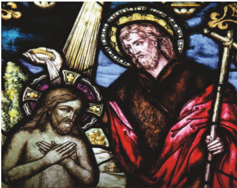
THE BAPTISM OF THE LORD This is what John the Baptist proclaimed: "One mightier than I is coming after me. I am not worthy to stoop and loosen the thongs of his sandals. I have baptized you with water; he will baptize you with the Holy Spirit." - Mk 1:7-8