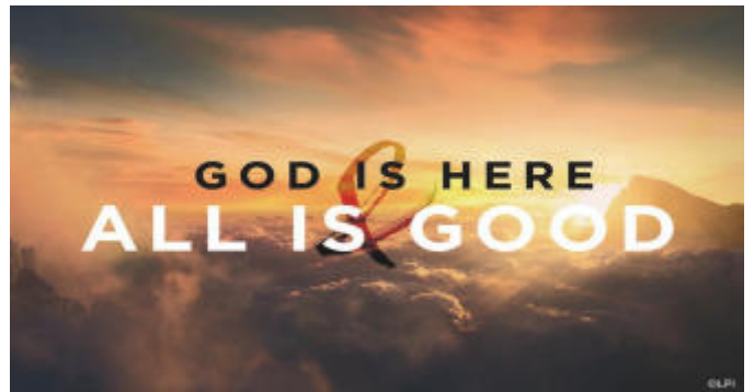
16TH SUNDAY IN ORDINARY TIME