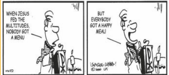
17TH SUNDAY IN ORDINARY TIME

May God bless all our faithful parishioners!