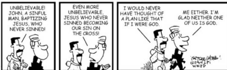
BAPTISM OF THE LORD