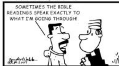
3RD SUNDAY IN ORDINARY TIME

ROSARY MEETING — Tuesday, February 19th, at 6:30 p.m.