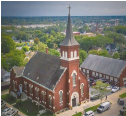
830 Elizabeth Street Joliet, Illinois 60435