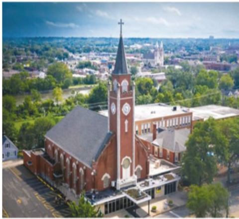
706 North Broadway Street Joliet, Illinois 60435