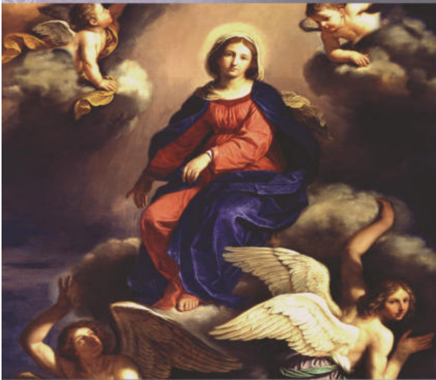
THE ASSUMPTION OF THE Blessed Virgin Mary

AUGUST 16, 2020 20TH SUNDAY IN ORDINARY TIME