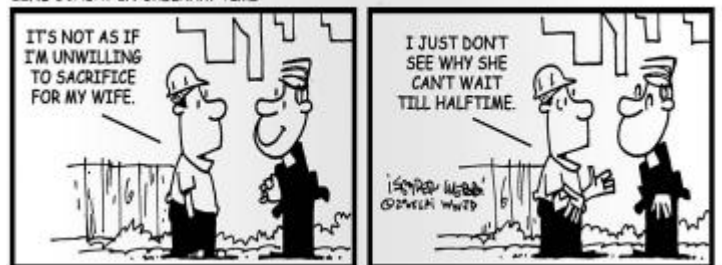
22ND SUNDAY IN ORDINARY TIME