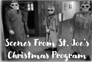
Scenes From St. Joe's Christmas Program

Wishing You A Very Merry Christmas and a Happy New Year From St. Joseph's School!