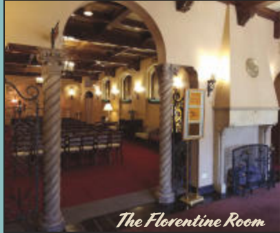
The Florentine Room