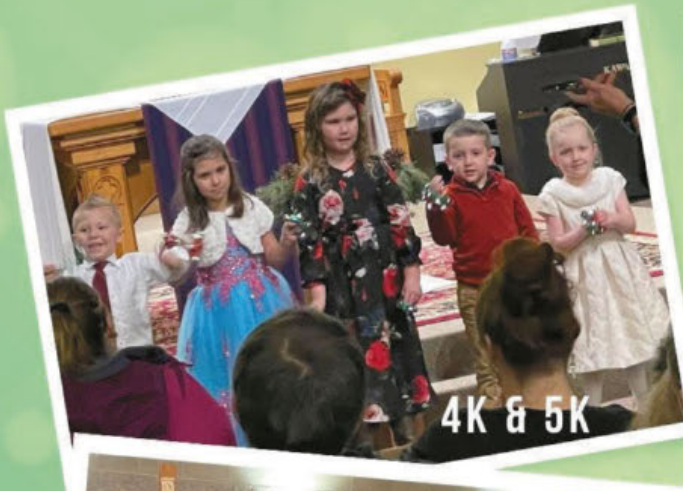
4K & 5K