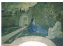
Christ with Martha & Mary Mikhail Nesterov

Our Family of Five Prayer Team actively prays for our community and parish family needs by offering personal prayers for submitted intentions.