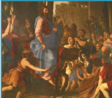
PALM SUNDAY OF THE PASSION OF THE LORD

NOTE 7:00 pm Mass at Ss. Peter & Paul is canceled.