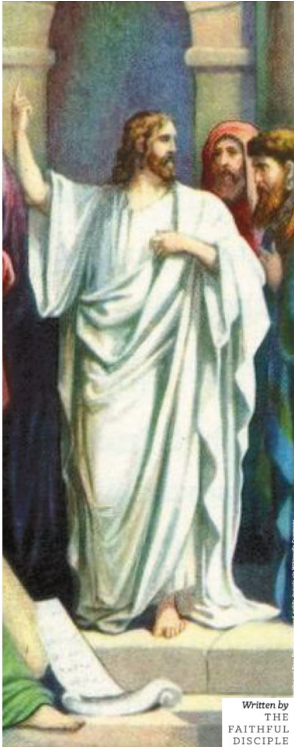
Written by THE FAITHFUL DISCIPLE

Parish Center Office 3010 E. Chandler Ave. Evansville, IN 47714 Phone: (812) 476-3061 www.AnnunciationEvv.org www.annunciationangels.org #AngelsEvv