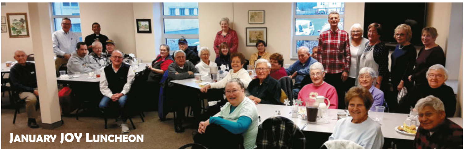
JANUARY JOY LUNCHEON

Tickets are now on sale Half-Pot Raffle and may be purchased through any Holy Cross Parishioner, or by contacting the Parish Office (812-753-3548). Daily drawings of $500 will begin February 1 and continue through February 27. A grand prize drawing of at least $10,000 will occur on February 28. Tickets are $20 each, or 6 for $100. License #001286