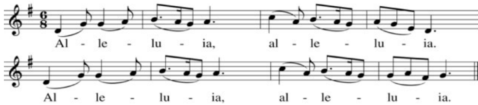
Music: Fintan O'Carroll, © 1985, GIA Publications, Inc.