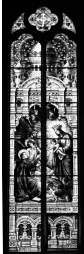
In the Basilica, the window on east wall is the apparition of the Blessed Mother with the Baby Jesus to St. Stanislaus Kostka