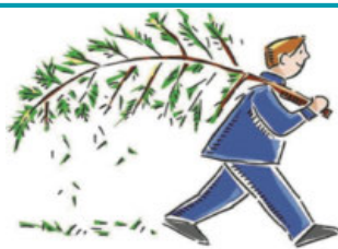
Removing of the Greens

Monday, January 10 th at 7 PM. Help us put away the Christmas decorations from the church and accessory buildings for another year.