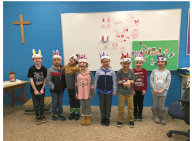
Our Kindergarten class poses with their bunny ear creations.