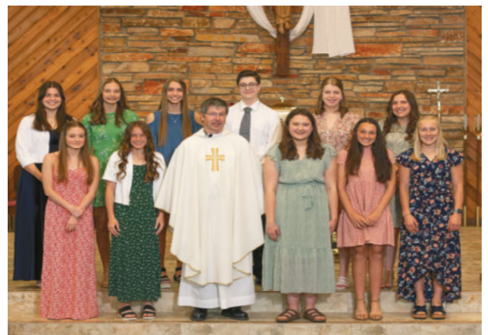
Confirmation Class 2022

Saturday & Sunday, June 4 & 5, 2022 Knight of Columbus Tootsie Roll Sale after Mass