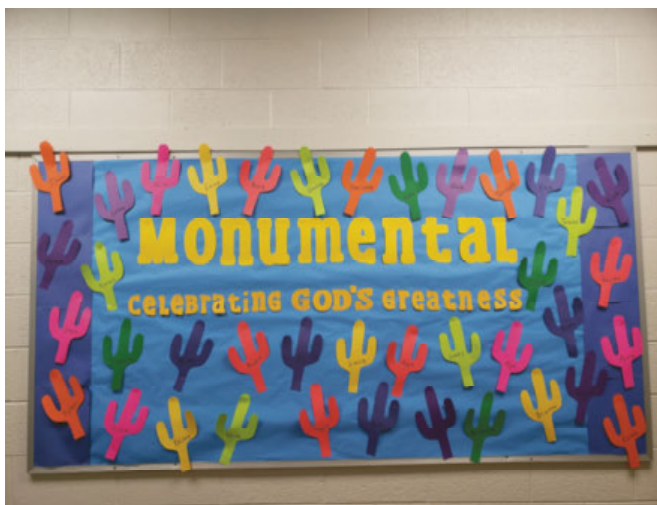
Bulletin Board in CCD Hallway

~From the Lifeteen Booklet: The Challenge of Saint John Paul II