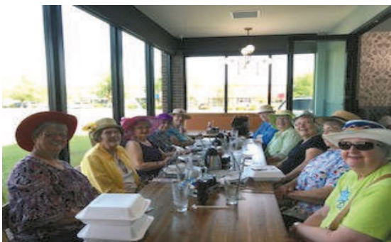
HATS OF COLLOR LADIES Enjoying Breakfast at Era Pancake & Buffet! Watch for our next outing! All ladies are welcome!

Catholic Daughters Court St. Rose will begin a new year on September 1, 2022 at 1p.m. at St. Therese Church. Please bring your August newsletter containing information that will be discussed and voted on, will save time when everyone has a chance to review budget and standing rules before hand.. Looks like it will be a very rewarding year lots of ways of expanding our work for the Lord in our churches, community and in our lives. Looking forward to seeing all. All area Catholic women are invited to come and learn about Catholic Daughters.