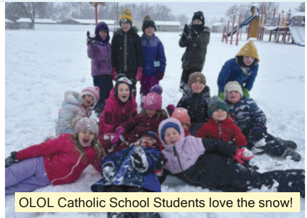
OLOL Catholic School Students love the snow!