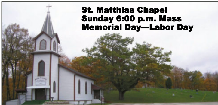
St. Matthias Chapel Sunday 6:00 p.m. Mass Memorial Day—Labor Day