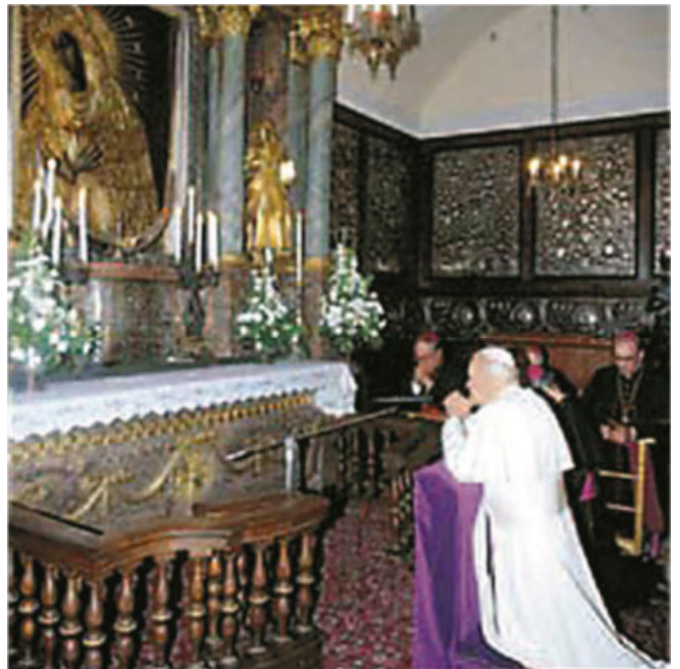
Saint John Paul II (in 1993), The Chapel of the Holy Mother of Mercy