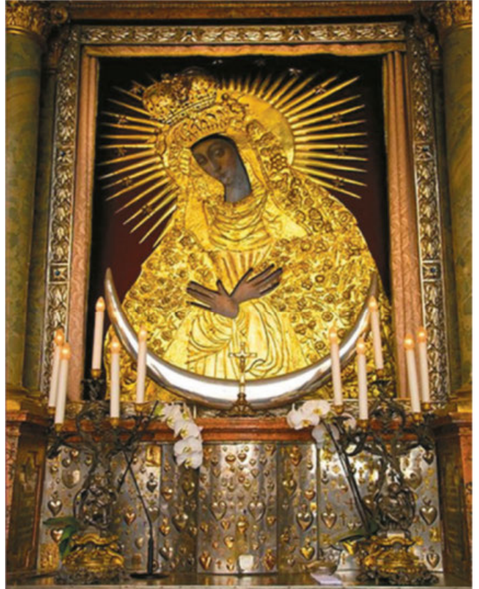
Our Lady of Mercy (November 16 th )