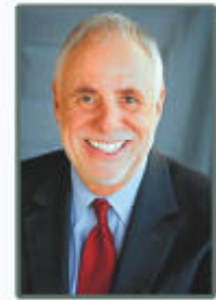
Keynote Speaker Former Illinois Supreme Court Chief Justice Robert Thomas

$90.00 per ticket/$125.00 VIP/$600.00 Clergy or student/$500.00 Table of 10. After October 26th, ticket prices increase to $100.00 per ticket/$130.00 VIP/$1000.00 Table of 10.