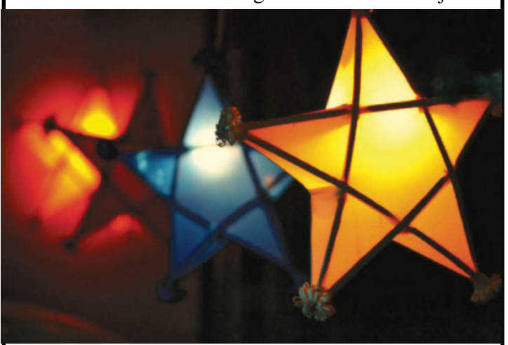
Merry Christmas and Happy New Year

Let us welcome the coming of the Lord and Rejoice.