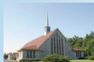
ST. MARY Catholic Church

Congratulations on the newest member of your family! Parents wishing to have their child baptized are asked to contact the Parish Office to make an appointment for pre-baptismal instruction.