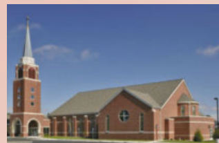
ST. JOSEPH Catholic Church

319 East South Street Lebanon, IN 46052 765-482-5558 www.stjoeleb.org