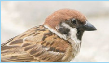
Sparrow

“And do not be afraid of those who kill the body but cannot kill the soul; rather, be afraid of the one who can destroy both soul and body in Gehenna. Are not two sparrows sold for a small coin? Yet not one of them falls to the ground without your Father’s knowledge. Even all the hairs of your head are counted. So do not be afraid; you are worth more than many sparrows.” Everyone who acknowledges me before others I will acknowledge before my heavenly Father. But whoever denies me before others, I will deny before my heavenly Father.” (Matthew 10:28-33)