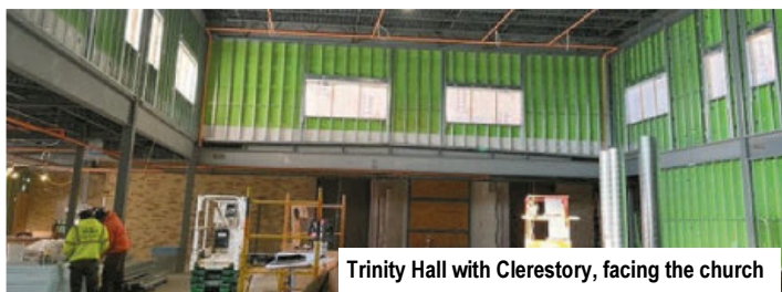
Trinity Hall with Clerestory, facing the church