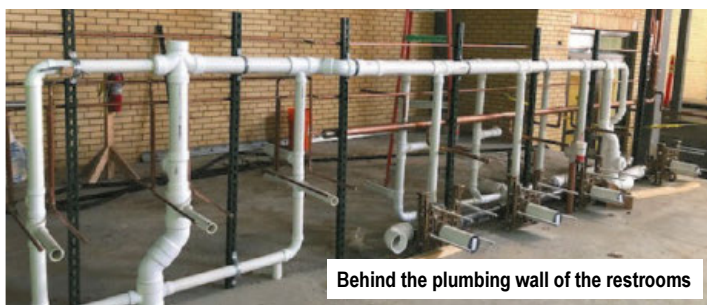
Behind the plumbing wall of the restrooms