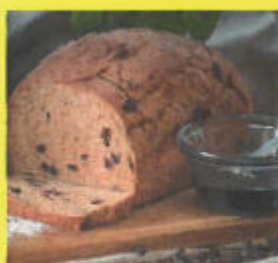
Health Bread 8.00