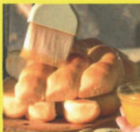
Dinner Rolls -6pk 6.00