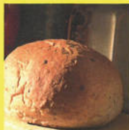
Wild Rice Artisan 7.00