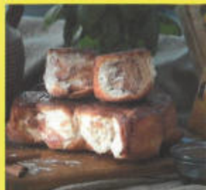
Caramel Rolls 10.00