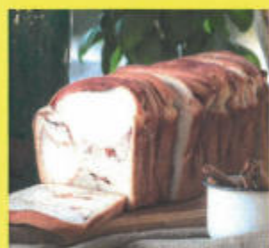
Cinnamon Bread 8.00

Orders Due By Sunday November 14 at Noon