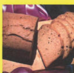
Zucchini Bread 9.00

Drive through -Pick up Orders after All Masses on Nov 20, 21 Garage