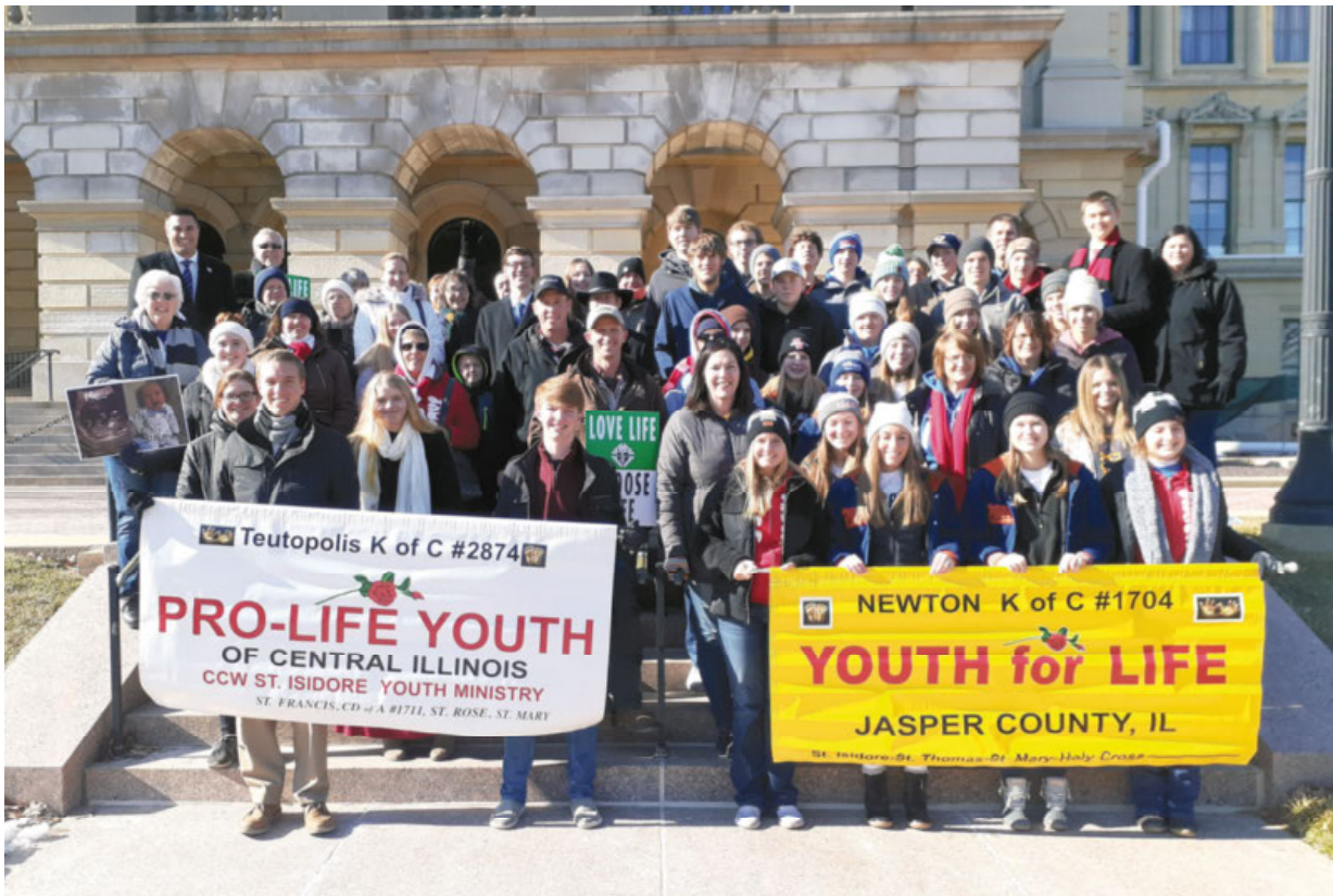
Parish participants in the March for Life held in Springfield, IL, on January 21, 2022.