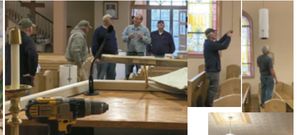
Thank you to everyone who helped!