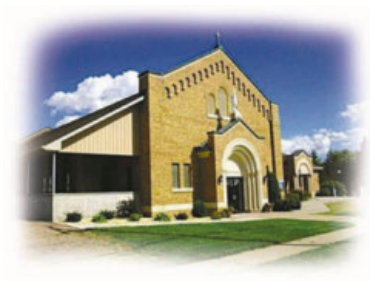
SAINT MICHAEL PARISH

3872 County P Blenker, WI 54415 (Mail) P.O. Box 177 Auburndale, WI 54412 (715) 652-2806