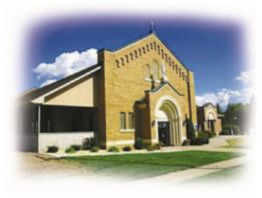
SAINT MICHAEL PARISH

3872 County P Blenker, WI 54415 (Mail) P.O. Box 177 Auburndale, WI 54412 (715) 652-2806