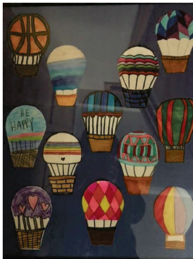
Artwork by Saint Nicholas students