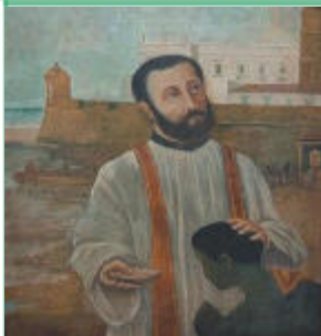
St. Peter Claver, Priest

A native of Spain, young Jesuit Peter Claver left his homeland forever in 1610 to be a missionary in the colonies of the New World. He sailed into Cartagena, a rich port city washed by the Caribbean. He was ordained there in 1615.