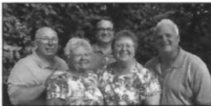
Voices of Peace Potter, WI