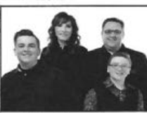
The Foresters Burton, MI