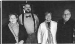
Loynachans Winterset, IA