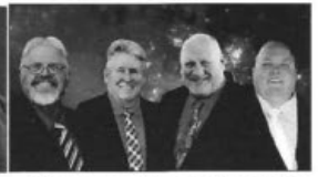
Common Bond Quartet Raceville, KY