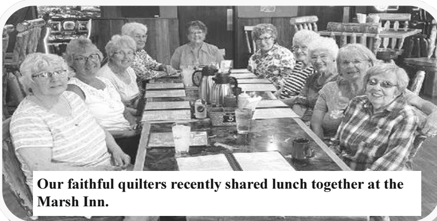
Our faithful quilters recently shared lunch together at the Marsh Inn.