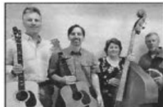
NorthWoods Gospel Rhineland, WI