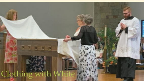
Clothing with White