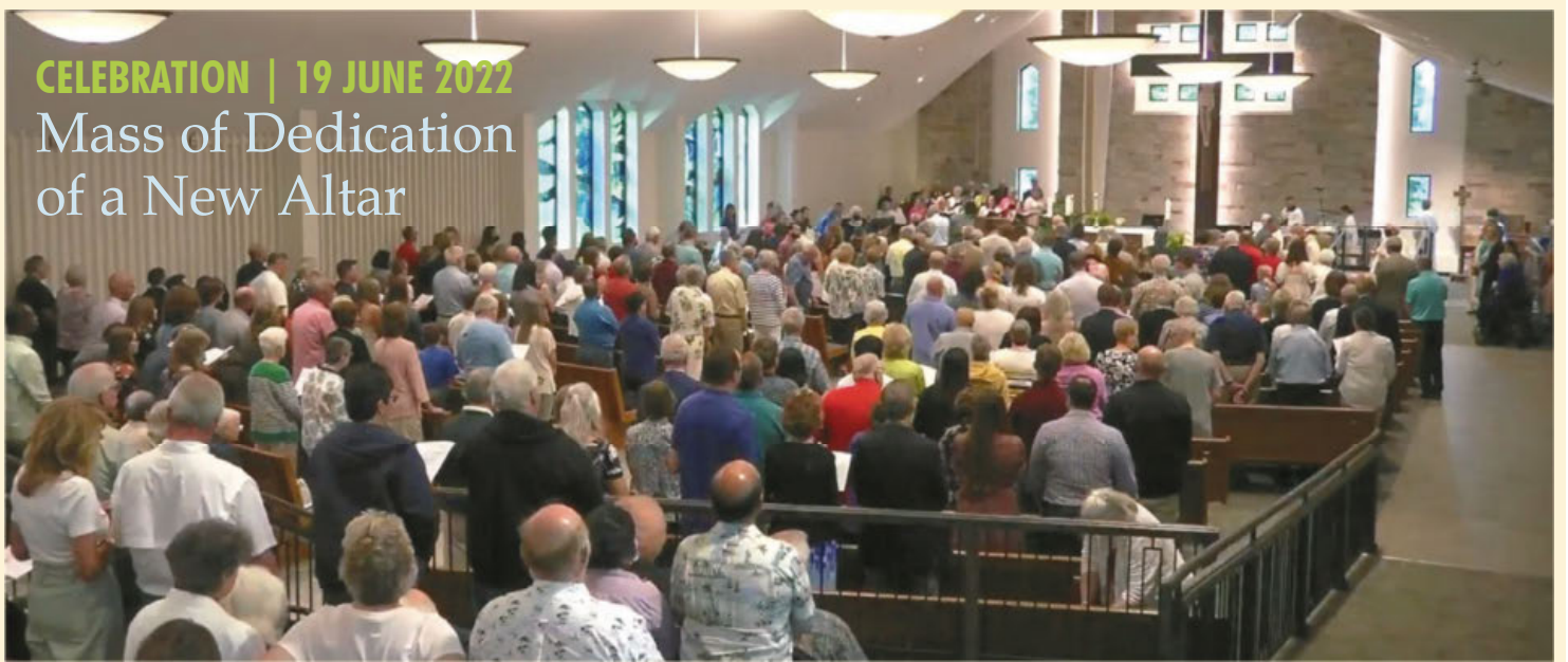
'BAPTIZING' OUR NEW ALTAR

Find more photos and video at StAnnesWausau.org/re-imagining .