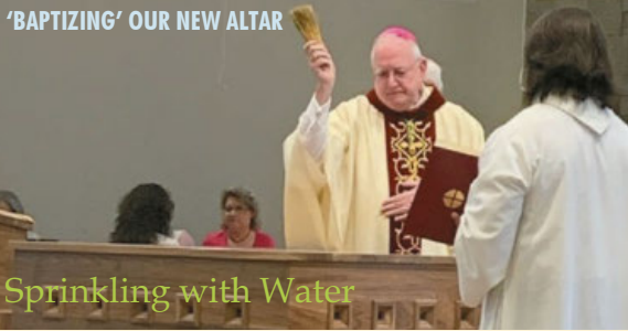
Sprinkling with Water

Find more photos and video at StAnnesWausau.org/re-imagining .