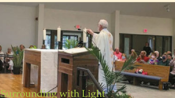
Surrounding with Light