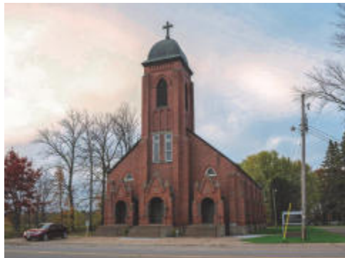
Mill Creek, WI