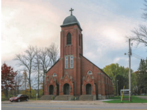
Mill Creek, WI