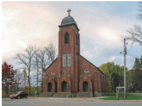
Mill Creek, WI