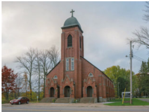
Mill Creek, WI